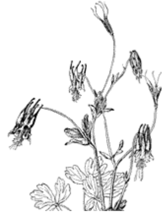
Columbine ( Aquilegia canadensis )

Need something for a wet area? Just ask! We've got lots of ideas.