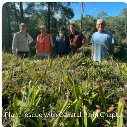
Plant rescue with Coastal Plain Chapter