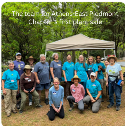
The team for Athens-East Piedmont Chapter's first plant sale