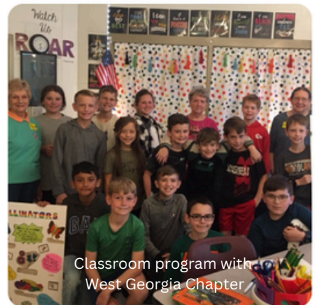
Classroom program with West Georgia Chapter