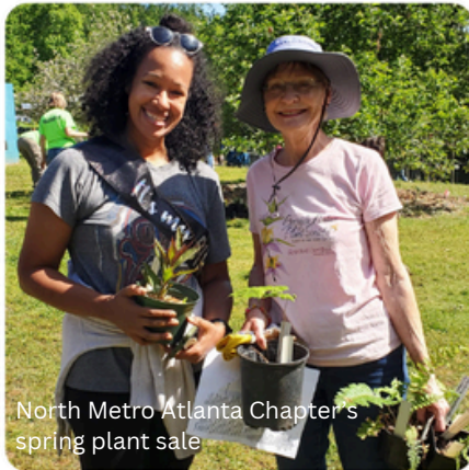
North Metro Atlanta Chapter's spring plant sale