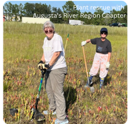
Plant rescue with Augusta's River Region Chapter