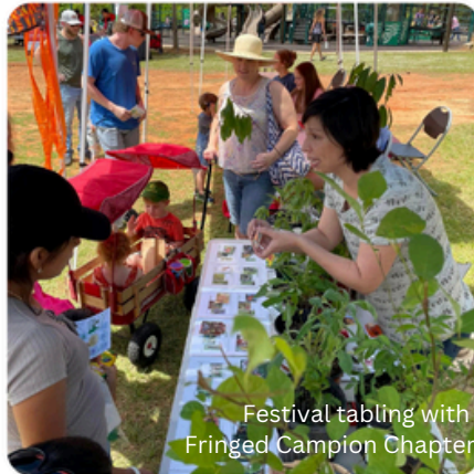
Festival tabling with Fringed Campion Chapter