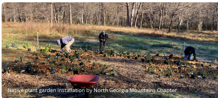
Native plant garden installation by North Georgia Mountains Chapter