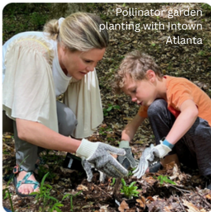
Pollinator garden planting with Intown Atlanta